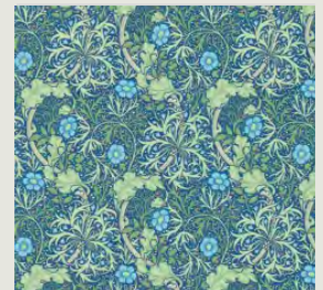
Morris Seaweed 1901