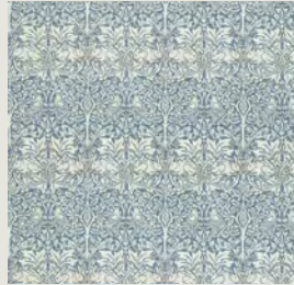
Brer Rabbit 1881