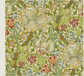
Golden Lily c.1899