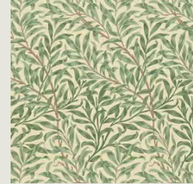
Willow Boughs 1887